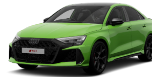
Kyalami Green 7R7R