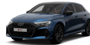
Ascari Blue 9W9W