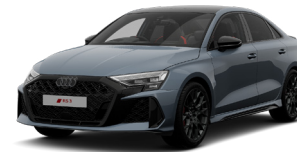
Kemora Grey 8R8R