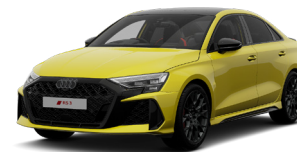
Python Yellow R1R1