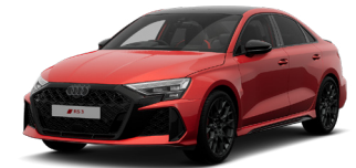
Progressive Red B1B1