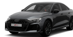
Daytona Grey 6Y6Y