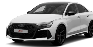
Arkona White Z9Z9