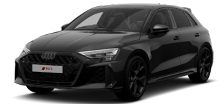
Myth Black OE0E